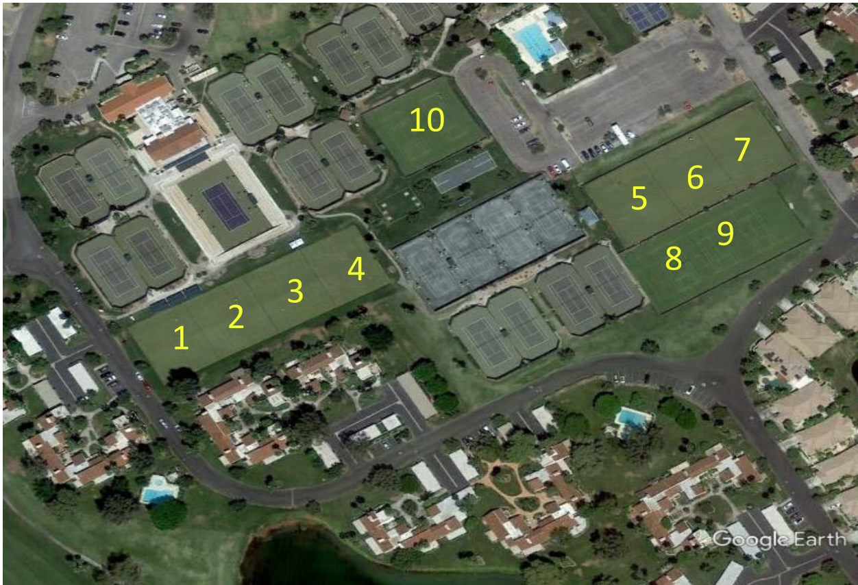
Google Earth Image with Croquet Lawns Numbered